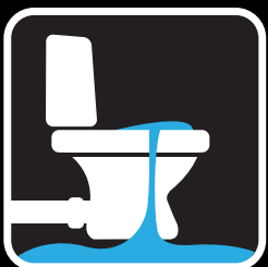
TOILET BACK FLOW