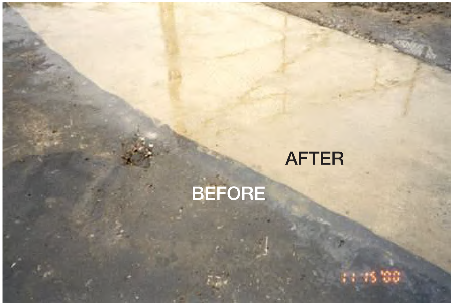
A section of pavement cleaned with Triple7 Heavy Duty