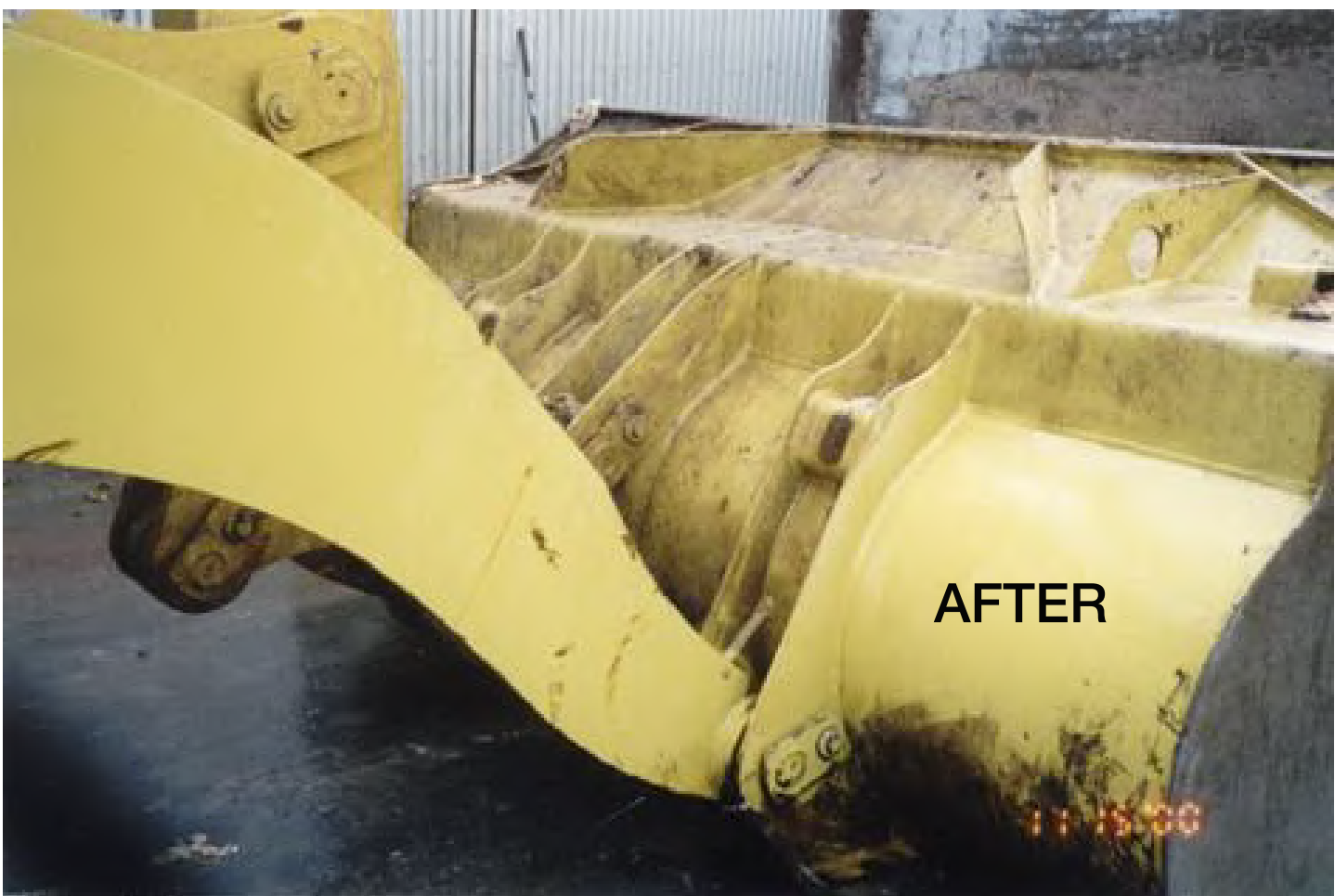
Triple7 Heavy Duty cleaning of machinery (only the front section has been cleaned).